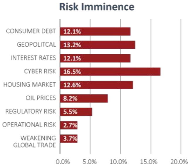
Figure 3: Top Ten Risks Weighted by Imminence