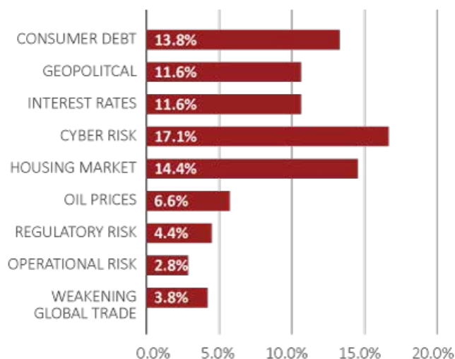
Figure 2: Top Ten Risks Weighted by Impact