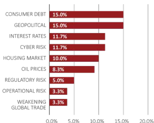
Figure 1: Top Ten Risks Identified by Members