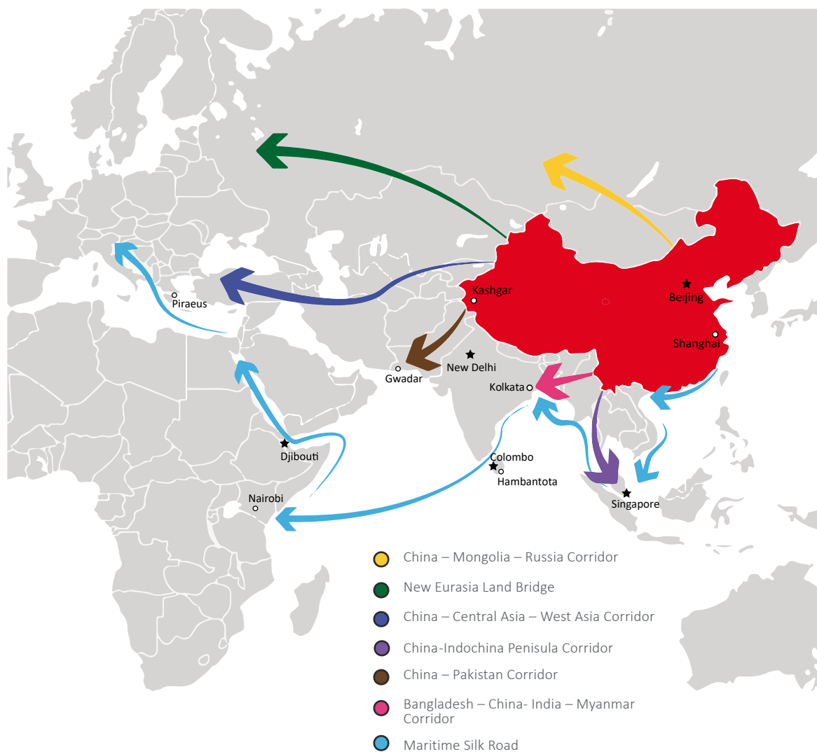
Table 1: States Traversed by the Belt and Road (By Corridor)